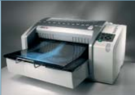
Durable and reliable by design