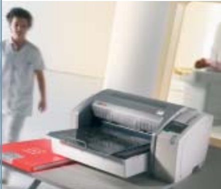
Convenient next-to-application imaging